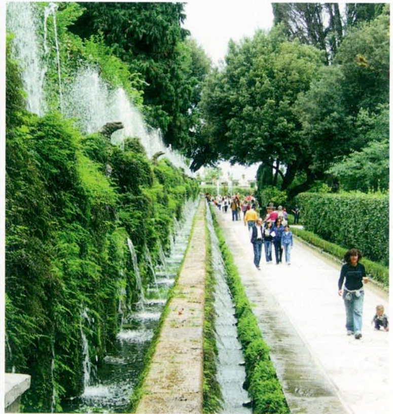
Canal at Villa d'Este in Tivoli, Italy.