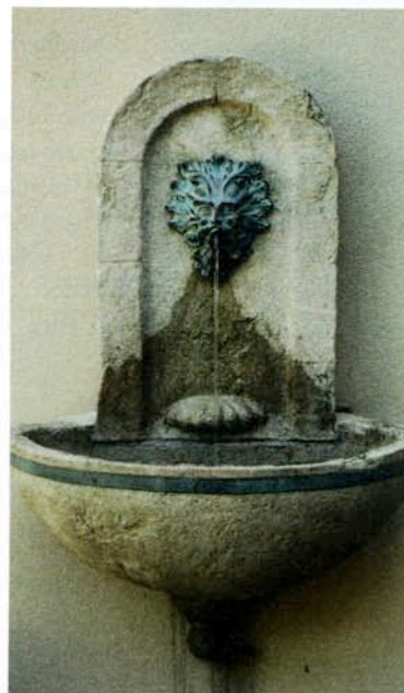
Mounted wall fountain in a private garden

is finished with a dark-blue bead that sparkles in the sun. The spa is centered on the shallow end and pours into the pool, creating ripples in the water. It is the focal point of the yard for a family with five children and three grandchildren, and is certainly the only place to be found on a day like today when the temperature registered at 106 degrees. Don't forget to consider built-in pool covers, lighting and sprays.