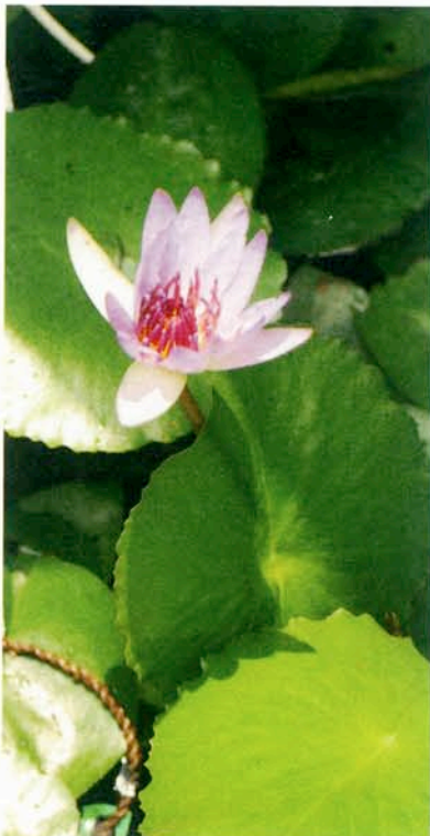
Display of water lilies in a pond at The Royal Gardens